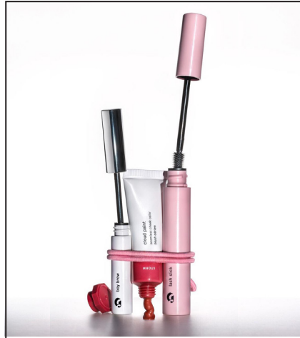
Stylized set example no.02