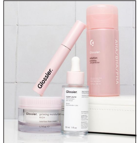
Stylized set example no.03