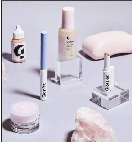
Stylized set example no.01

A 'styled set' refers to a unique arrangement of surfaces, props, and lighting. See examples below. Camera angle is not considered part of the set. Working with fewer styled sets is one way to keep project costs down.